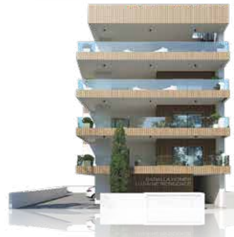
LUJIANE RESIDENCE Central Larnaca