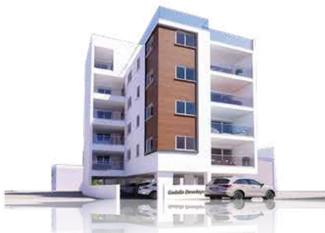
MARIAM RESIDENCE American Academy, City Center