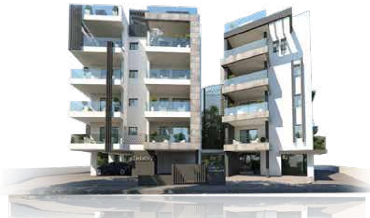
HORREYA RESIDENCE Chrysopolitissa, Larnaca