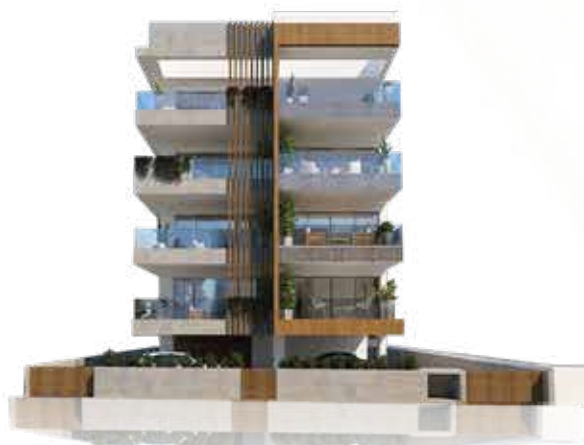
JASMINE RESIDENCE Spyrou Kyprianou (Sklavenitis), Larnaca