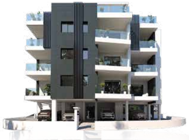
KAMARES VIEW 2 RESIDENCE Kamares, Larnaca