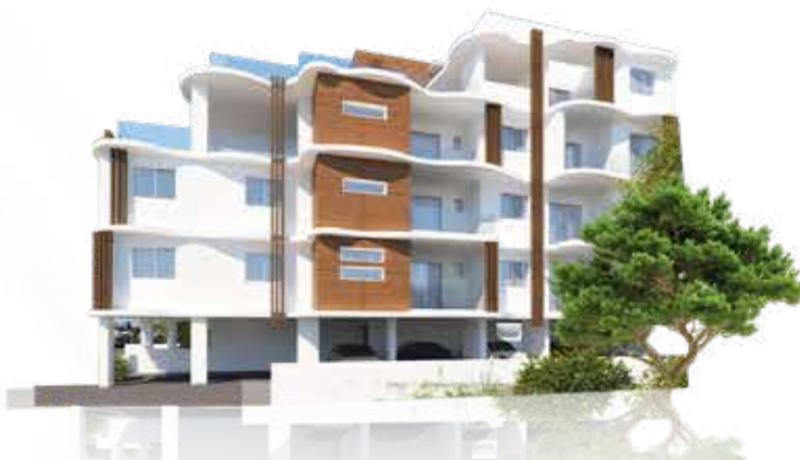
KAMARES VIEW 1 RESIDENCE Kamares, Larnaca